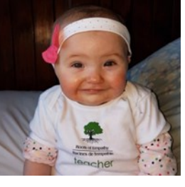
Not baby Patrick!

The Roots of Empathy instructor also visits before and after each family visit to prepare and reinforce teachings using a specialised lesson plan for each visit. Research results from national and international evaluations of Roots of Empathy indicate significant reductions in aggression and increases pro-social behaviours.